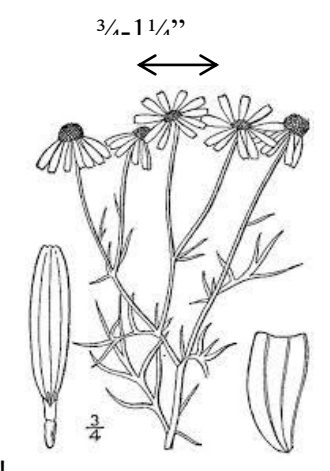
White petals, yellow center fern or feather like leaves

Carry a garbage bag with you, put the weeds in it and carry them out. If the seed heads are left in the wild, they may spread the weed even more!