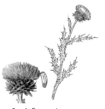
Purple flowers, Leaves extend down stalk Musk Thistle

Yes and no. Most weeds you see should not be picked because they respond by growing back stronger. Some should not be picked because the native and invasive species are hard to tell apart. Some species can be picked because they are only spread by seed. ESWA is recommending two types of weeds should be picked — Musk Thistle and False Chamomile. Carry a garbage bag with you, put the weeds in it.