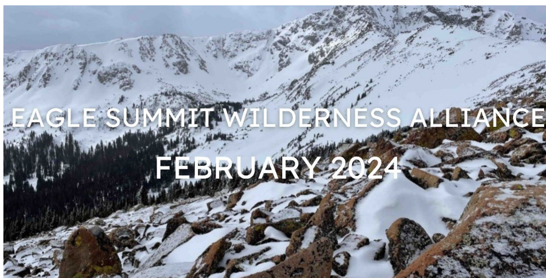
Holy Cross Wilderness

ESWA'S 2 ND ANNUAL WILD & SCENIC FILM FESTIVAL - MARCH 2 YOU'RE INVITED – GET TICKETS TODAY & INVITE YOUR FRIENDS!