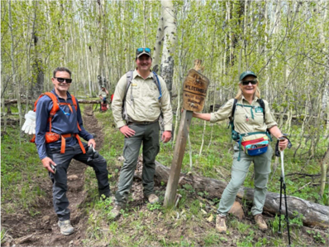
At the Flat Tops Wilderness boundary – finally!

The Hilltop Trailhead (above Sweetwater Lake) is the only currently approved access for VWR patrols. Our trip plan was to do a loop from the TH up Turret Creek to Johnny Meyers Trail/Nellie's Trail back to Turret Creek, and out - about 7 miles. Our route ended up being: