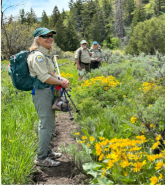
Arrowleaf Balsamroot in the Flat Tops Wilderness