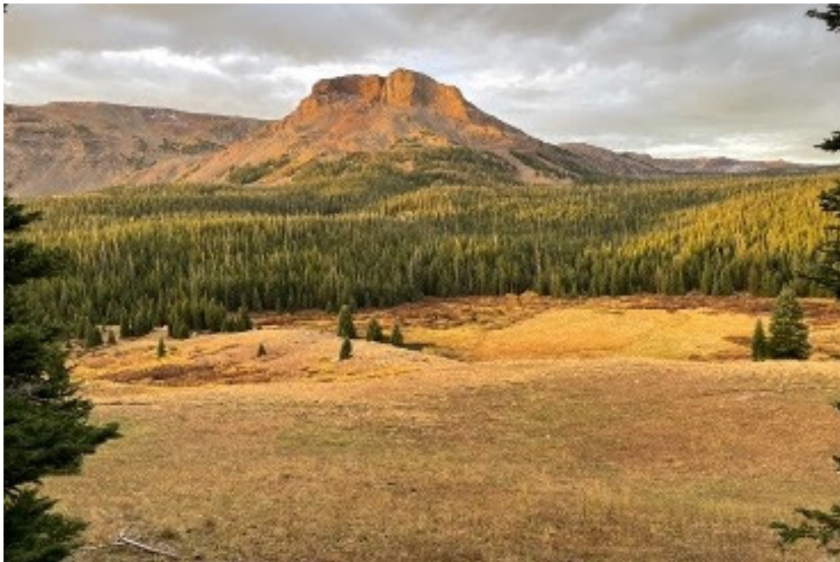
Sheep Mountain, Flat Tops Wilderness

NOTE: There will be a wonderful opportunity to experience the Flat Tops in more depth on the Llama Trip August 24-27. Sign up soon!