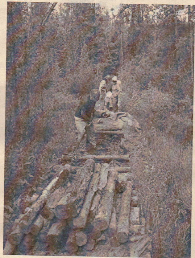
Mesa Cortina Turnpike During