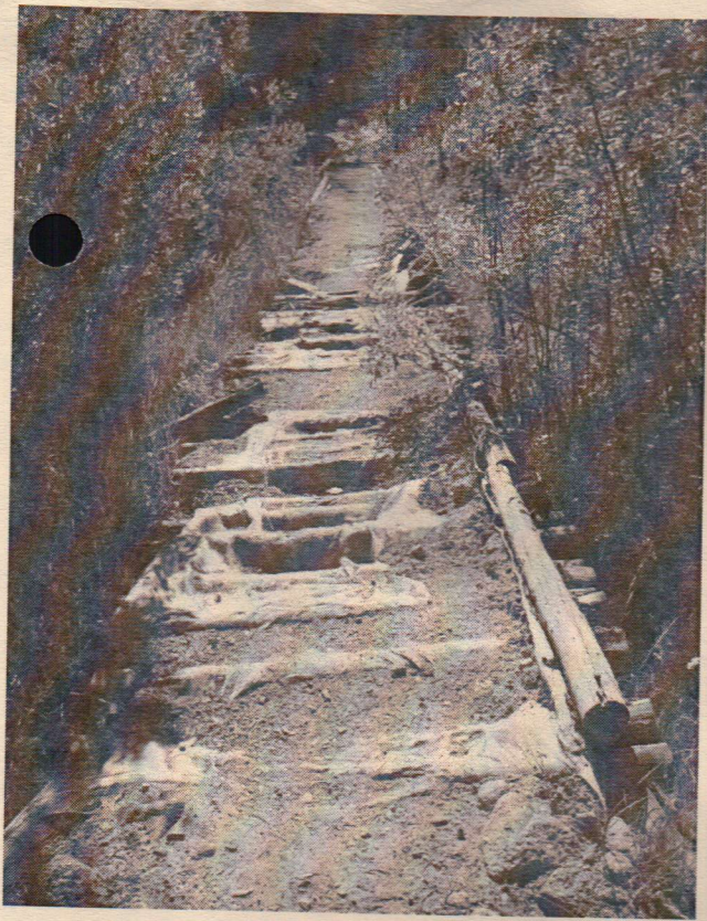
Mesa Cortina Turnpike Before