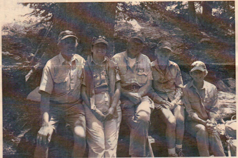
Eagle County Volunteer Rangers