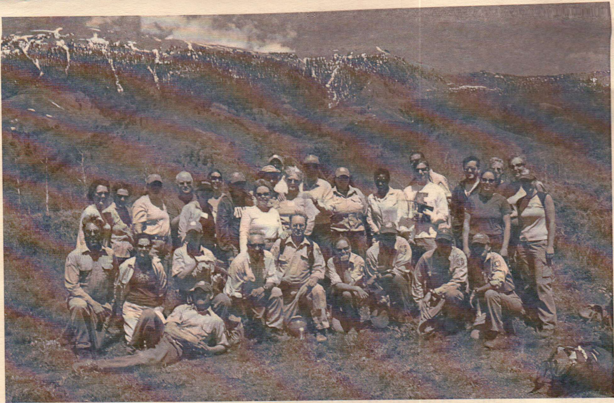
Acorn Creek Trail Crew