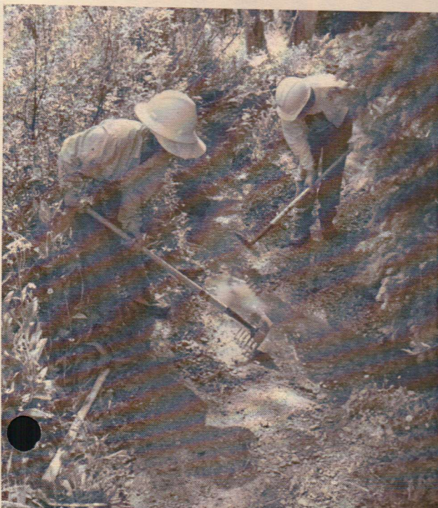
Mesa Cortina Trailwork