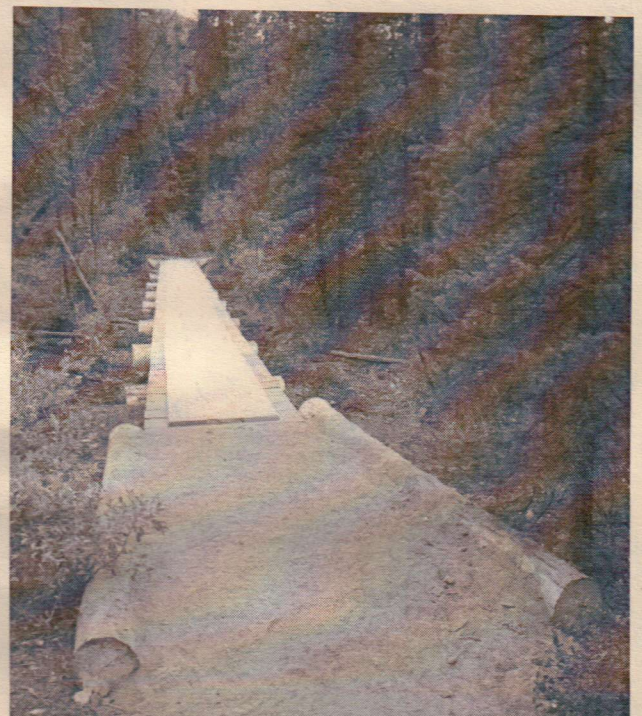
Mesa Cortina Turnpike After